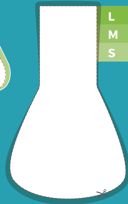
WiZARD 320 Full Face Mask